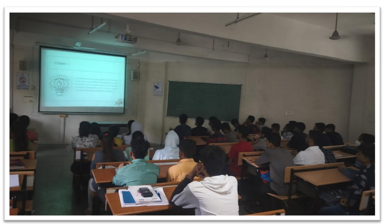
SSIP 2.0 awareness program at Computer Department