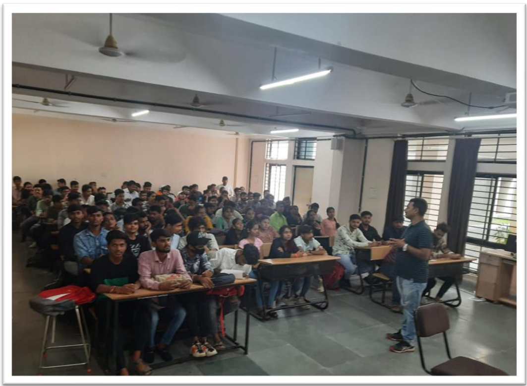
SSIP 2.0 Awareness program at Electrical Department