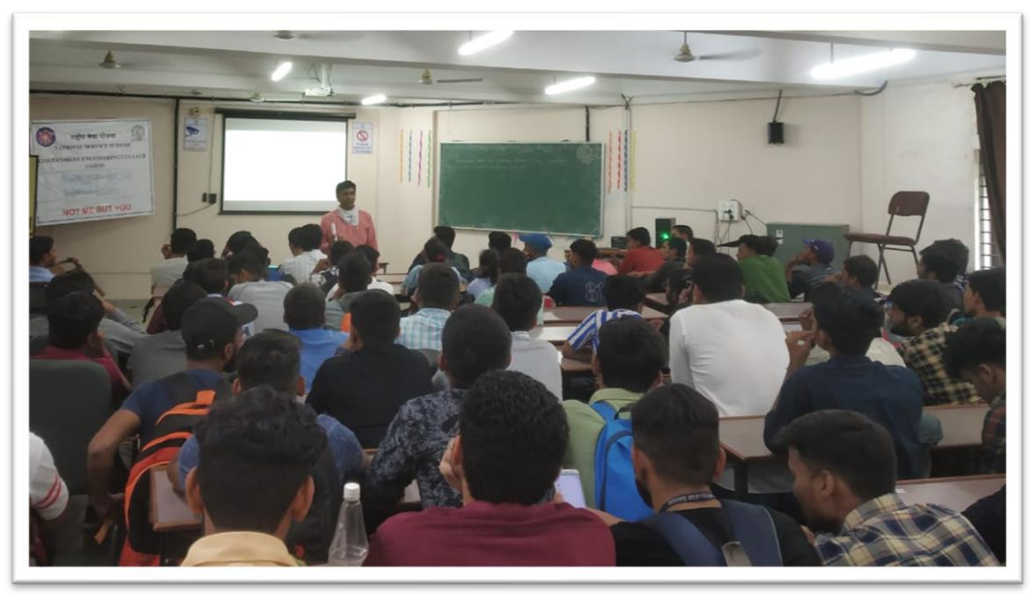
SSIP 2.0 Awareness Program at Mechanical Department