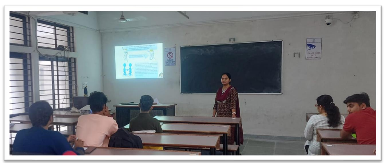
SSIP 2.0 Awareness program at EC department